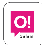
Nur Telecom (Kyrgyzstan)