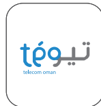
Telecom Oman (Oman)